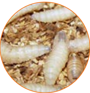
Magnified mature larvae